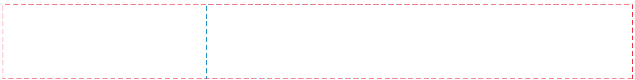
Top Branding @100

Branding : 170 x 20 mm (w x h) ----- 4CP Digital Print