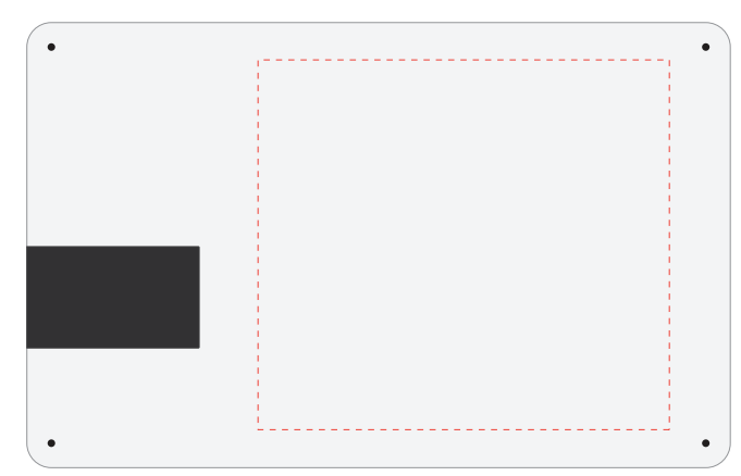
Front Print size : 50mm x 45mm Pad Print, Laser Engrave, 4CP Direct Digital

Print Process: Pad Print, Laser Engrave, 4CP Digital Print Product Size: 85 x 54 x 2 mm Colours: Product Colour: Black, Silver