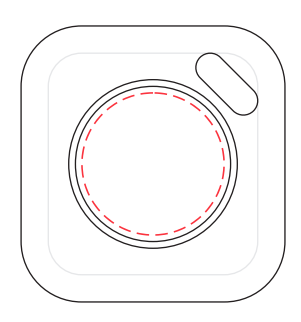
Rear Branding: 19 mm Diameter 4CP Digital Print Pad Print