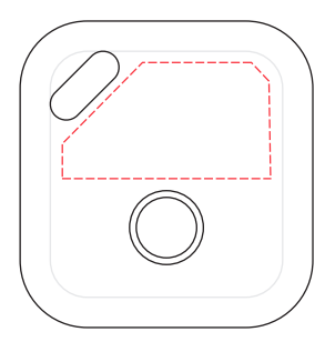
Front Branding: 25 x 14 mm (w x h) 4CP Digital Print Pad Print

Branding Options : 4CP Digital Print Product Size : 35 x 35 x 9.3 mm Colours : Product Colour: Black, White