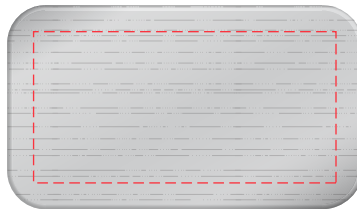
Aluminium Plate Size: 46.5 x 26.5 mm