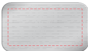
Aluminium Plate Size: 46.5 x 26.5 mm