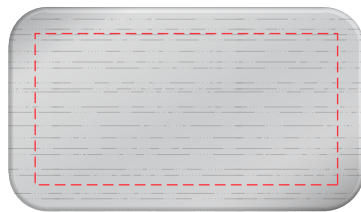
Aluminium Plate Size: 46.5 x 26.5 mm