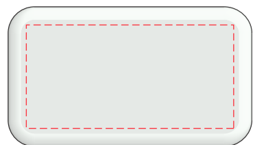
Epoxy Doming Sticker size: 46.5 x 26.5 mm