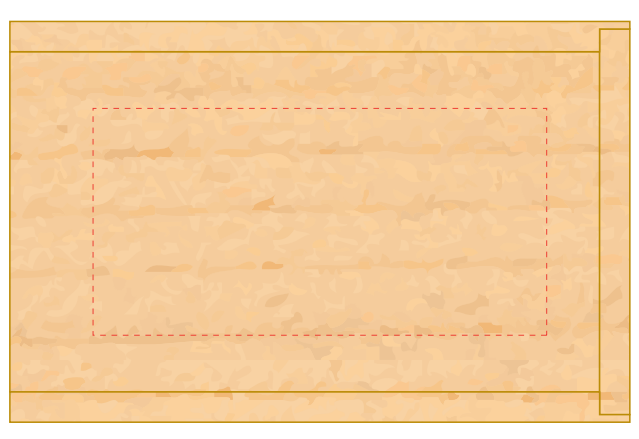
Under side Print size : 60mm x 30mm Pad Print or Laser Engrave